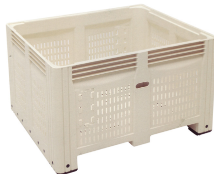
Jumbo Bin 748h-2 Way Entry